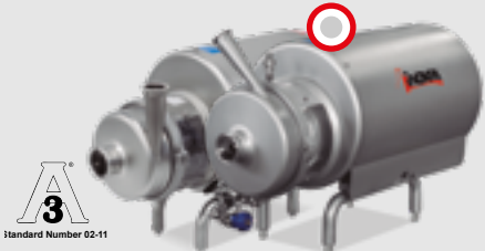
Centrifugal pumps: Prolac HCP, Prolac HCP-WFI