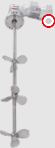
Agitator with mechanical seal: CXC